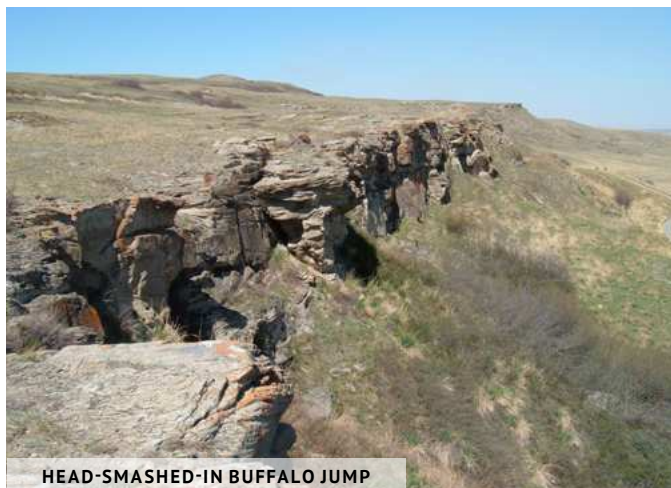
HEAD-SMASHED-IN BUFFALO JUMP