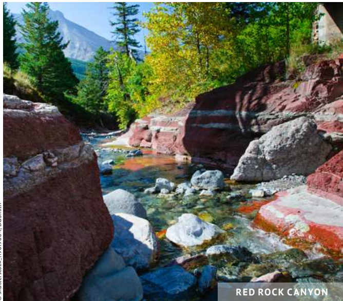
RED ROCK CANYON

This short, moderately-difficult hike is a favourite with locals and visitors alike. From a distance, the mountain looks like the outline of a grizzly bear. Benches are located along the way, and a final set of steps leads you up to the flat top of the "hump". From here you will enjoy superb views of views of the mountain peaks down the valley and the prairies to the north.