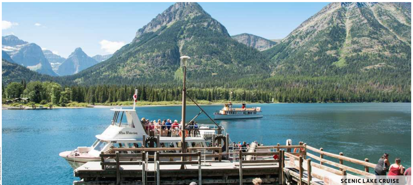
SCENIC LAKE CRUISE