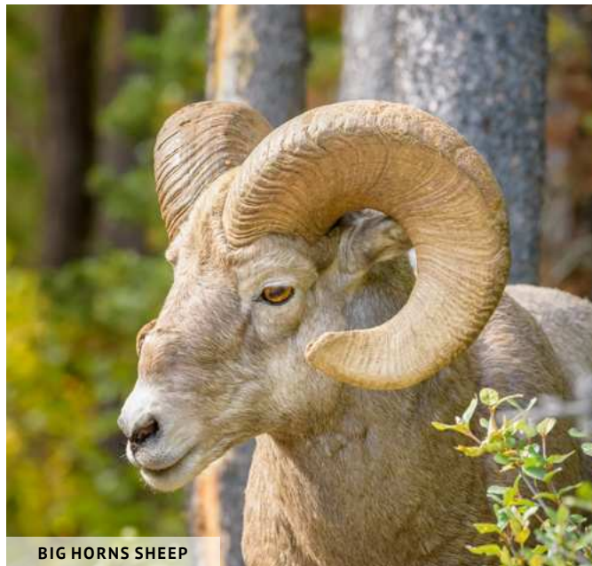
BIG HORNS SHEEP