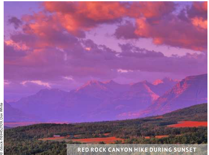
RED ROCK CANYON HIKE DURING SUNSET