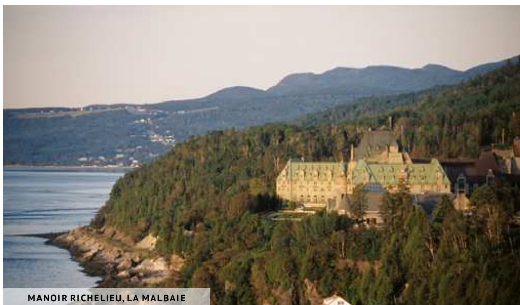
MANOIR RICHELIEU, LA MALBAIE