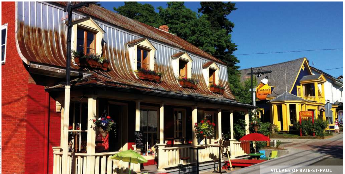
VILLAGE OF BAIE-ST-PAUL