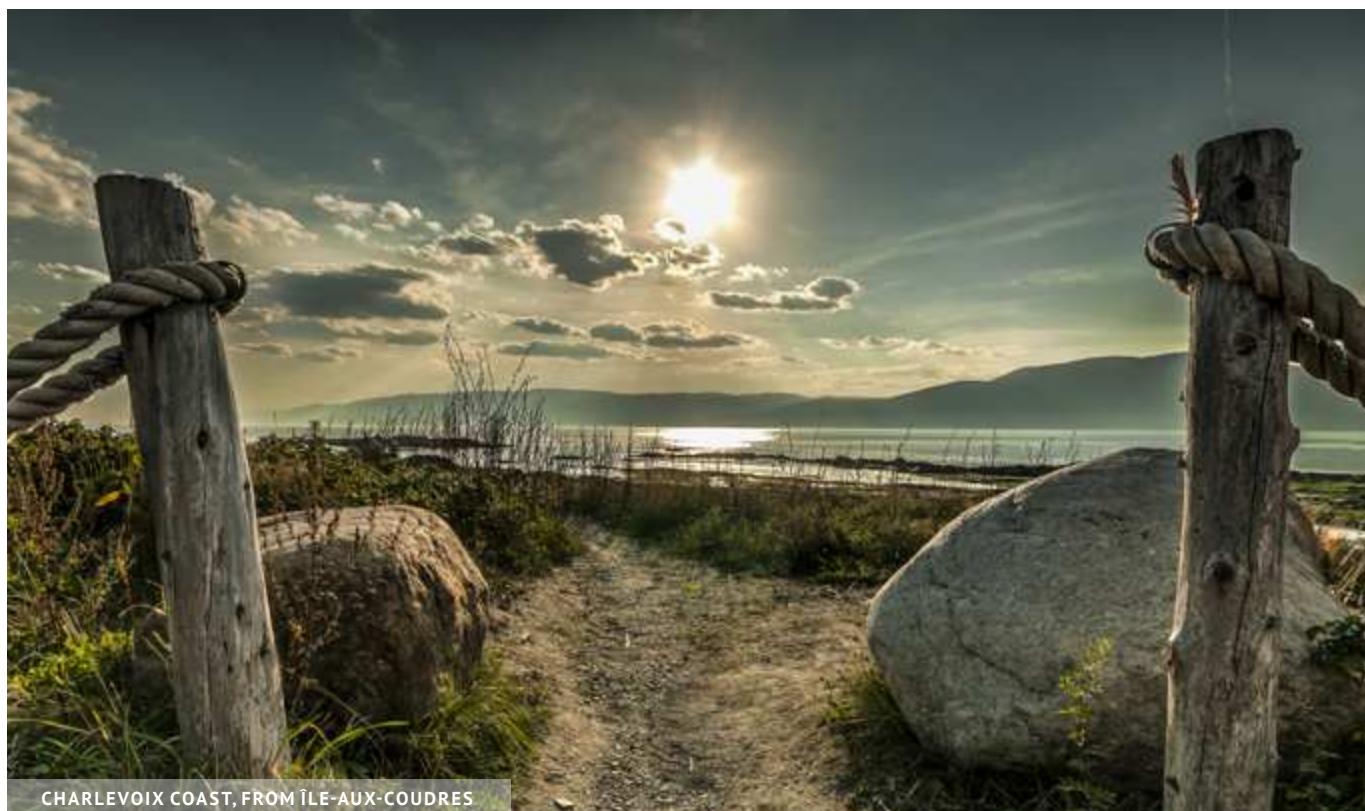
CHARLEVOIX COAST, FROM ÎLE-AUX-COUDRES