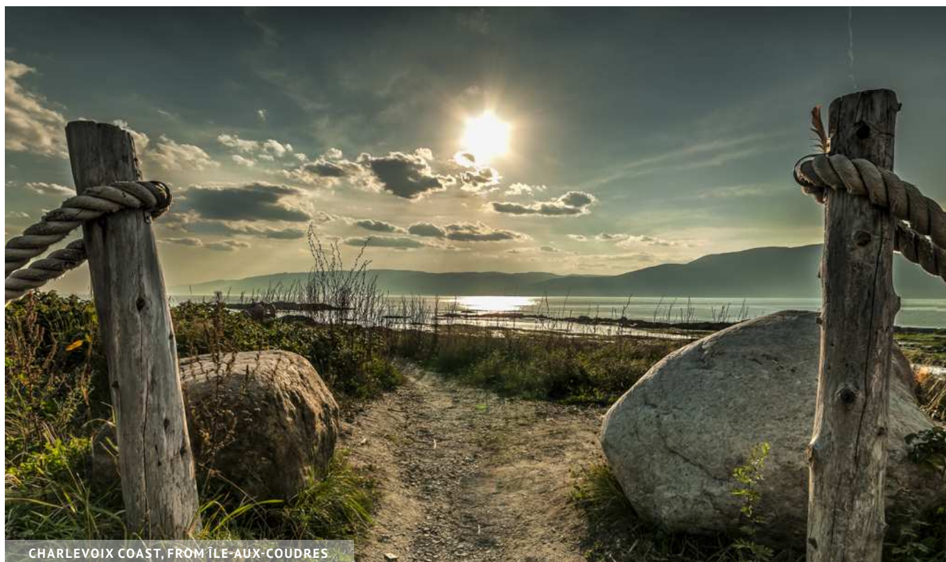
CHARLEVOIX COAST, FROM ÎLE-AUX-COUDRES