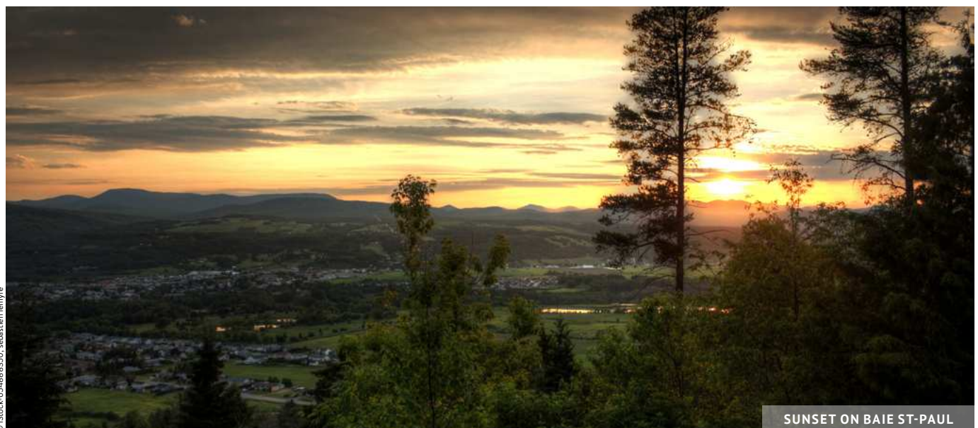
SUNSET ON BAIE ST-PAUL