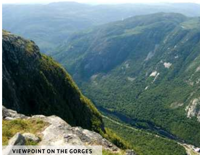
VIEWPOINT ON THE GORGES