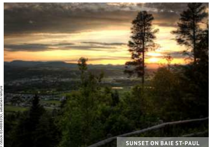
SUNSET ON BAIE ST-PAUL