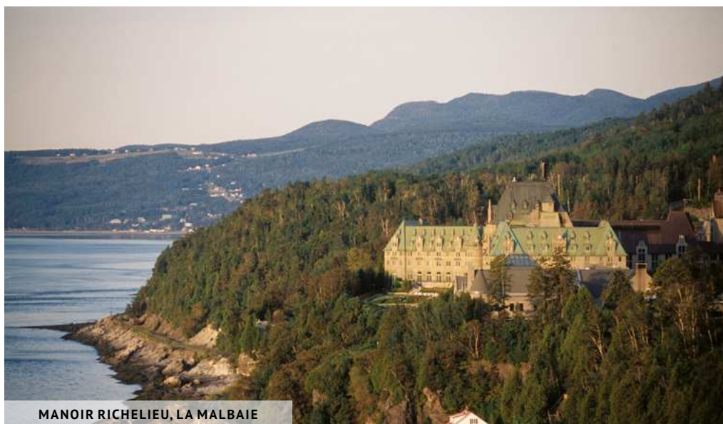
MANOIR RICHELIEU, LA MALBAIE