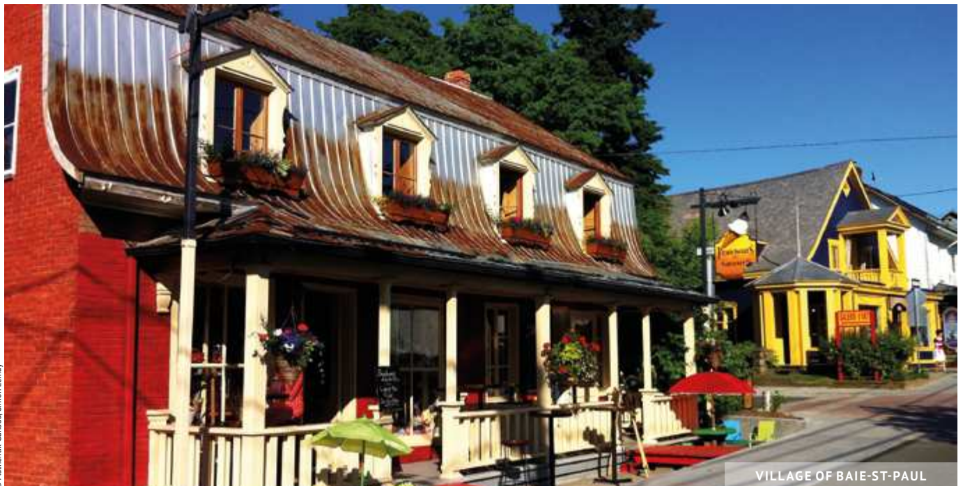
VILLAGE OF BAIE-ST-PAUL