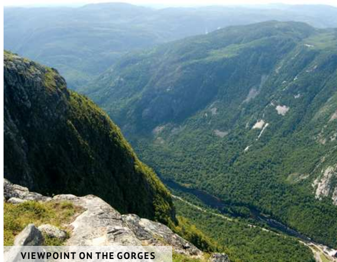
VIEWPOINT ON THE GORGES