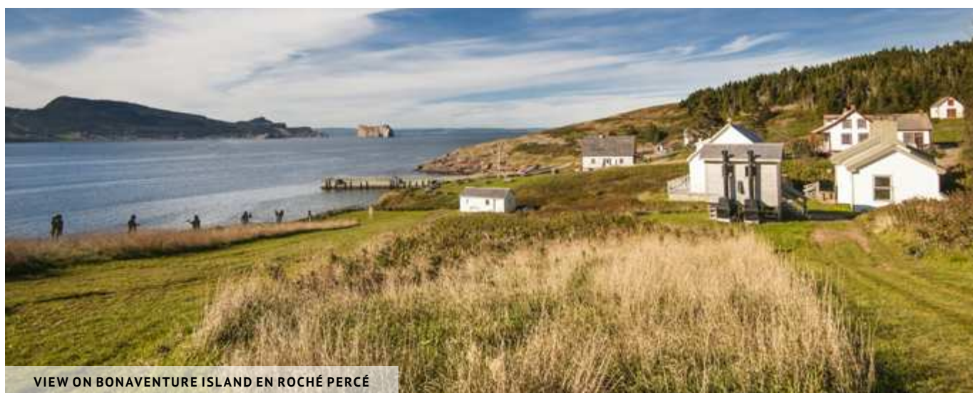
VIEW ON BONAVENTURE ISLAND EN ROCHÉ PERCÉ

The Rivière aux Émeraudes (Rivière-du-Portage) site, in the Coin-du-Banc area, is one of the trailheads for the Sentier des Rivières Trail , which stretches 27 km through the forest. From the parking lot, a short hike on a portion of the trail called Rivière-du-Portage Sector will take you to the bottom of the valley to admire a waterfall of rare beauty . The color of the water is breathtaking. Choose a sunny day for this excursion. Bring your camera and your swimsuit! Accessible from early May to late October. CHEMIN DE LA CARRIÈRE, PERCÉ 418-782-5448