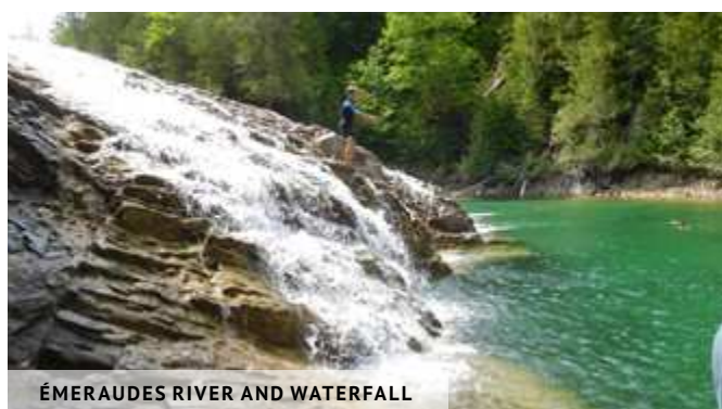
ÉMERAUDES RIVER AND WATERFALL