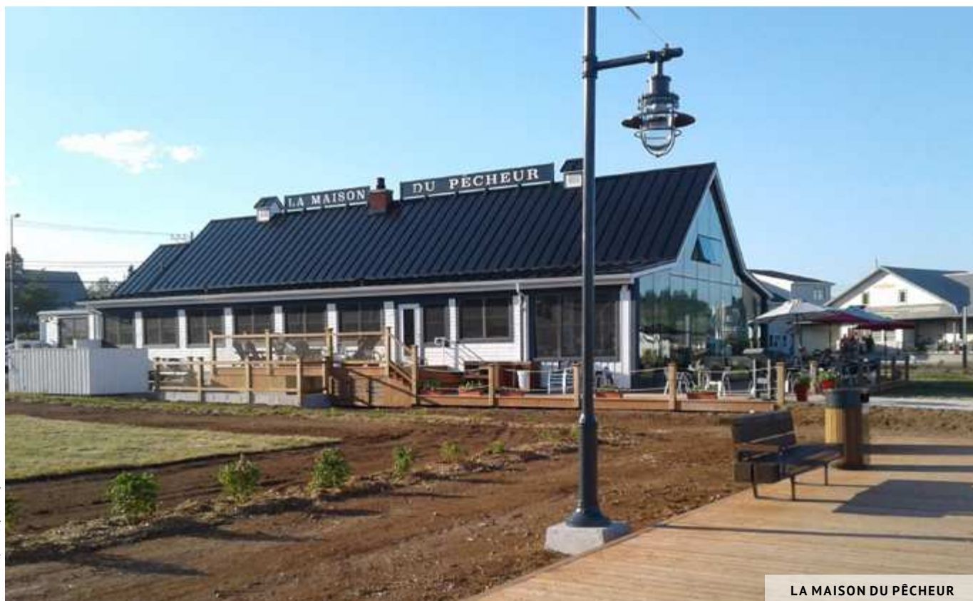
LA MAISON DU PÊCHEUR