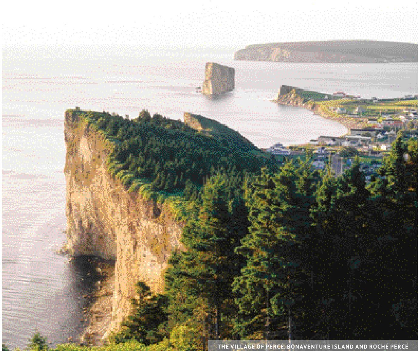
THE VILLAGE OF PERCÉ, BONAVENTURE ISLAND AND ROCHÉ PERCÉ