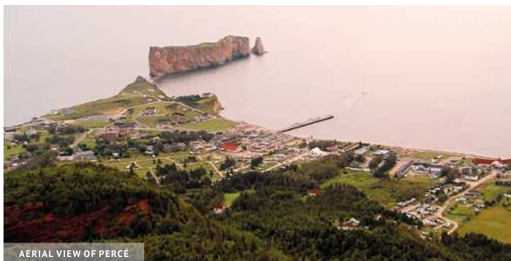
AERIAL VIEW OF PERCÉ