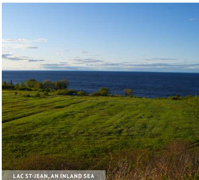
LAC ST-JEAN, AN INLAND SEA