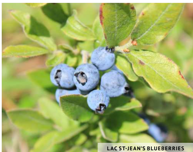
LAC ST-JEAN'S BLUEBERRIES