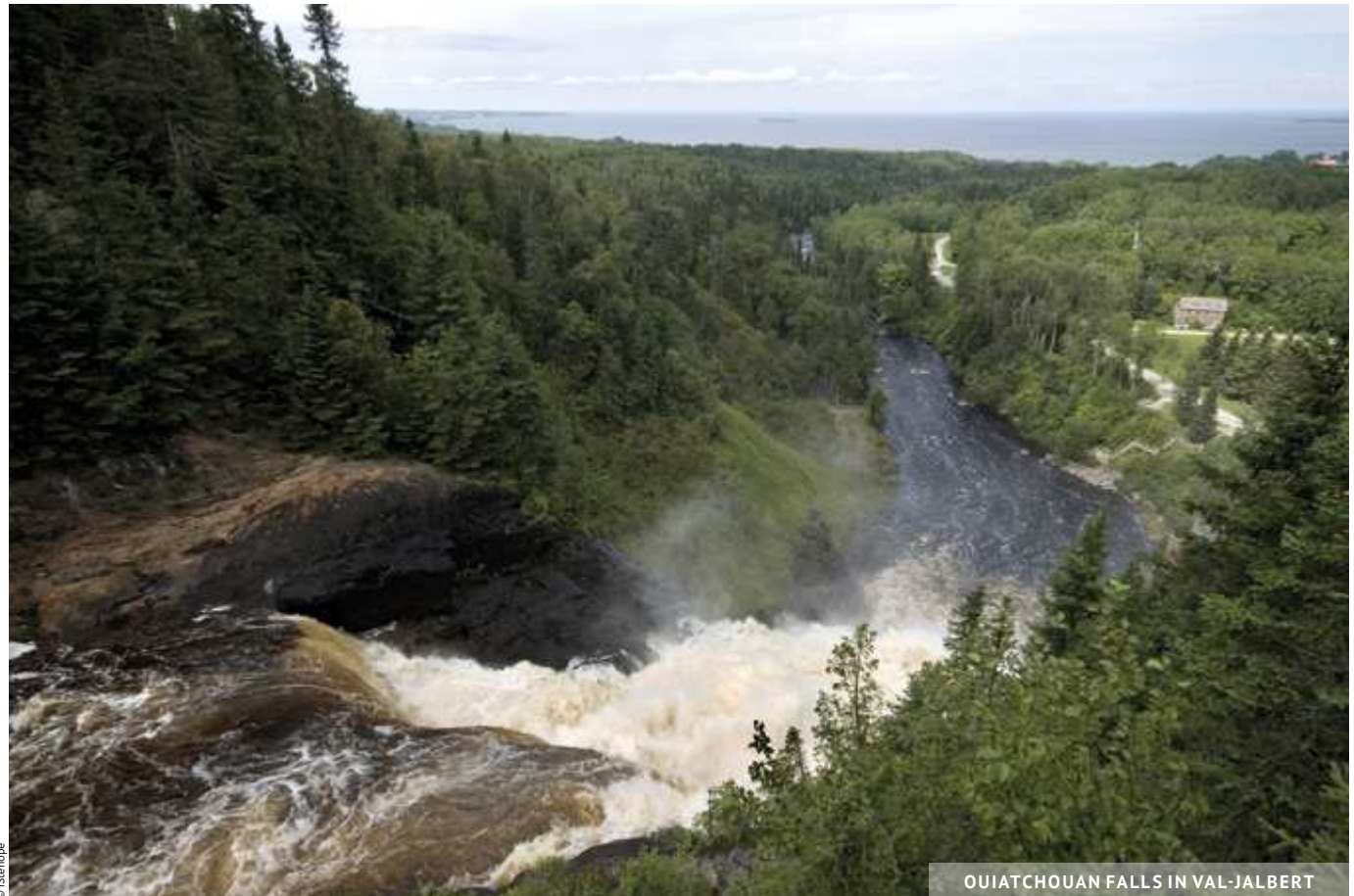
OUIATCHOUAN FALLS IN VAL-JALBERT