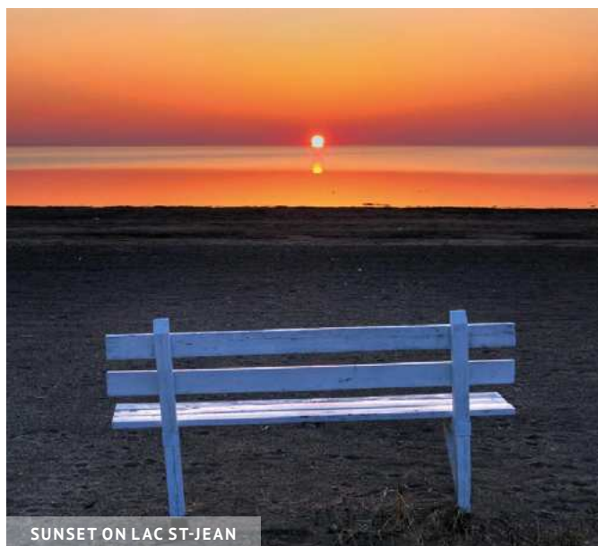
SUNSET ON LAC ST-JEAN