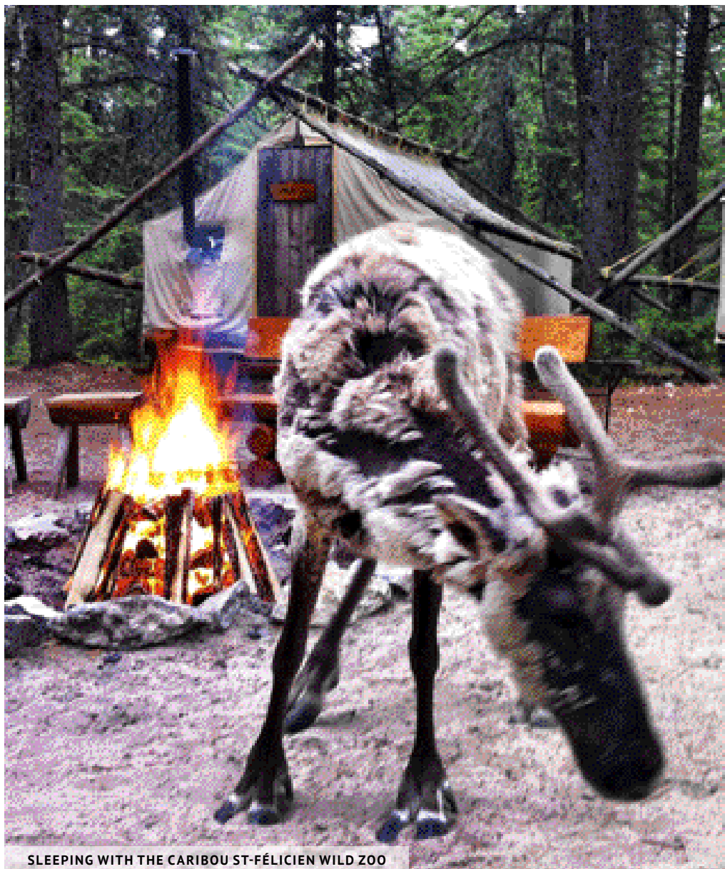
SLEEPING WITH THE CARIBOU ST-FÉLICIEN WILD ZOO

This wild zoo is different from traditional zoos: it houses only animals from Boreal climates , i.e. from the world's northern regions such as Canada, Alaska, northern Russia and certain areas of Asia (Japan) and Europe. There are more than 500 animals of 86 different species and 4.5 km of hiking trail. At Saint-Félicien Wild Zoo, visitors enjoy a unique experience as they take a ride on board a screened-in train along nature trails where humans are in cages, while the animals roam free! You will also find on the site some shops, a main restaurant and several dining areas if you want to bring your picnic. 2230, BOULEVARD DU JARDIN, SAINT-FÉLICIEN 418-679-0543 WWW.ZOOSAUVAGE.ORG