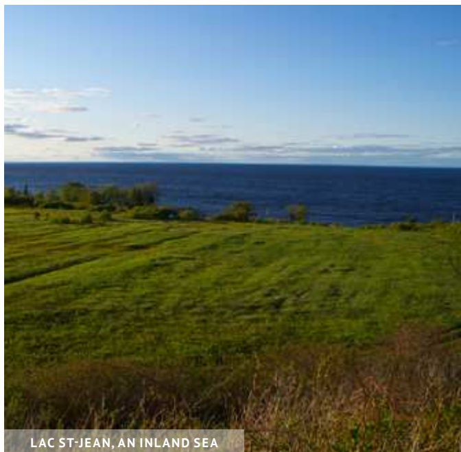
LAC ST-JEAN, AN INLAND SEA