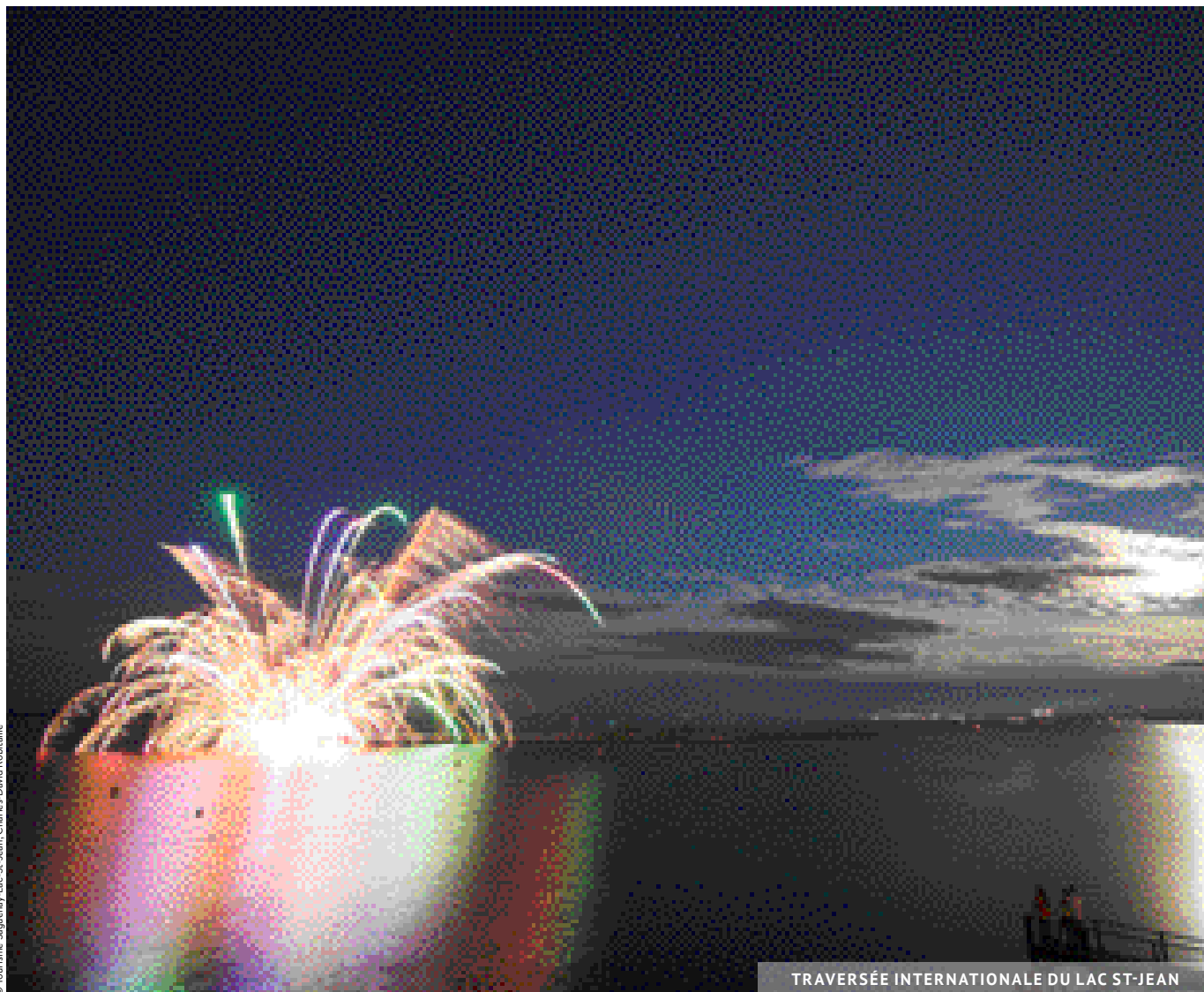
TRAVERSÉE INTERNATIONALE DU LAC ST-JEAN