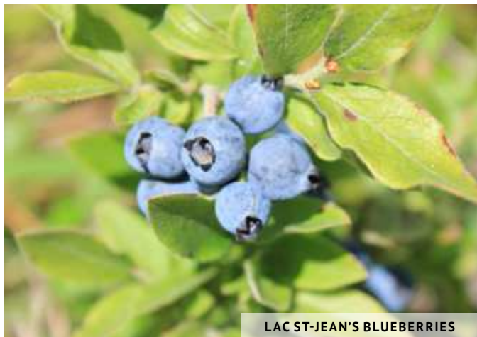
LAC ST-JEAN'S BLUEBERRIES