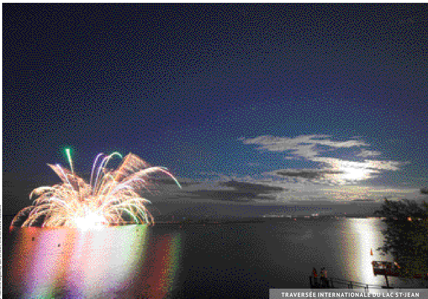
TRAVERSÉE INTERNATIONALE DU LAC ST-JEAN