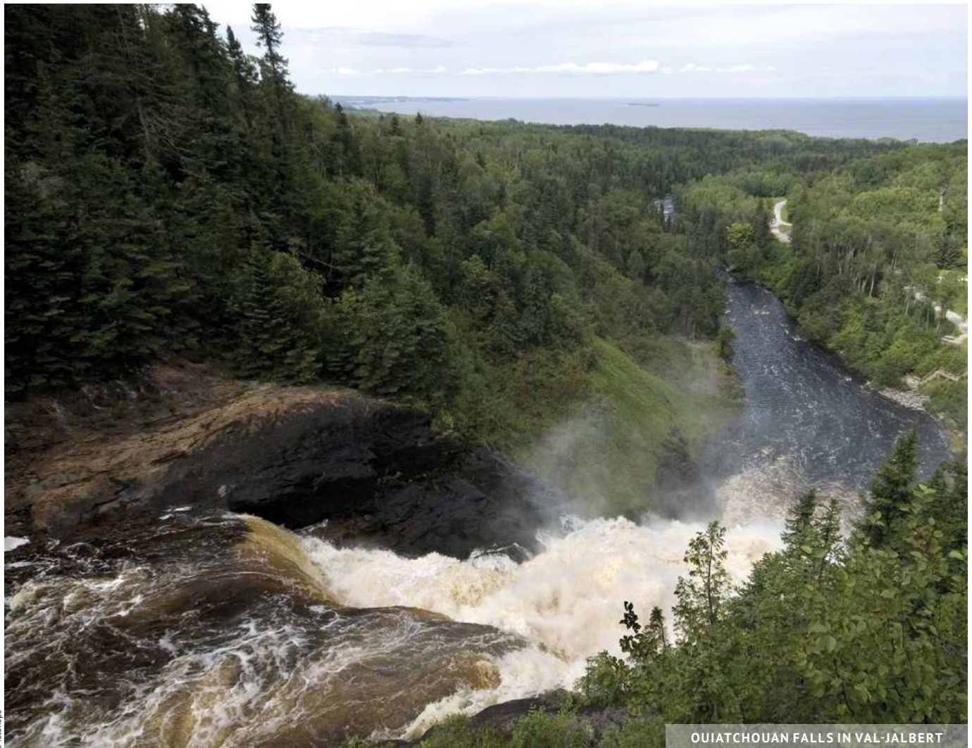
OUIATCHOUAN FALLS IN VAL-JALBERT