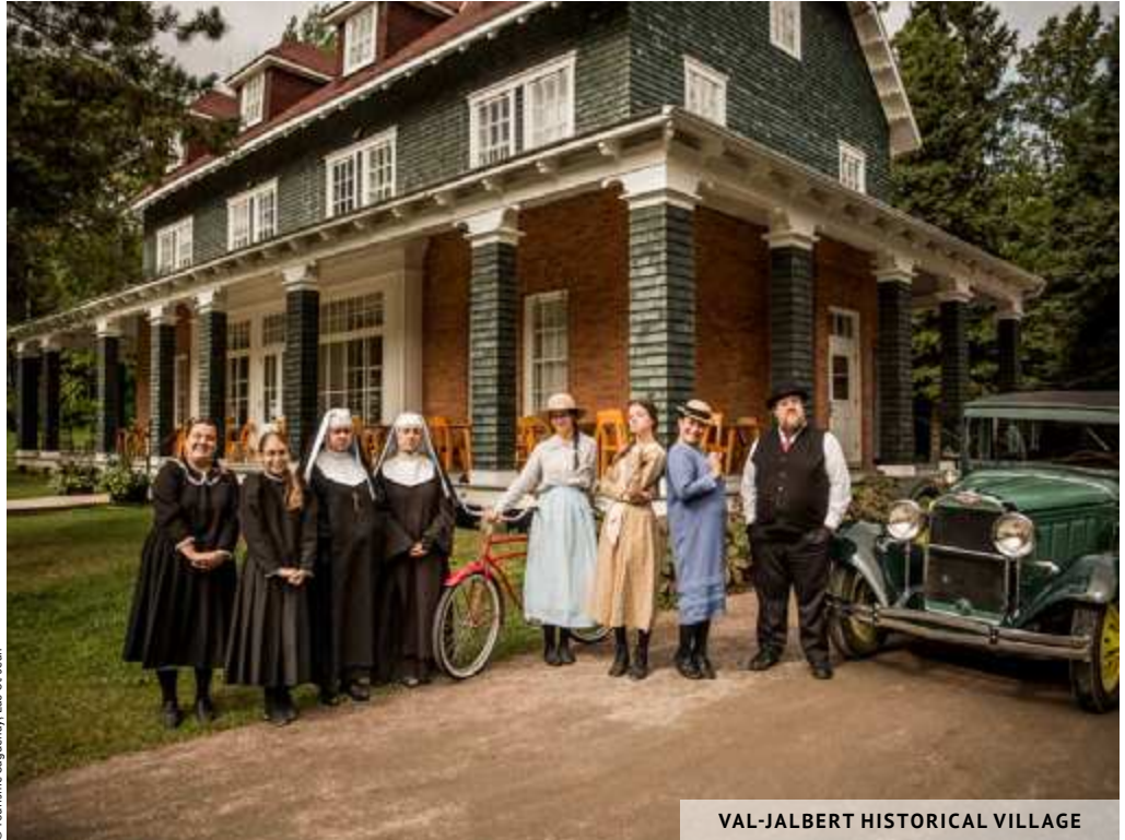
VAL-JALBERT HISTORICAL VILLAGE