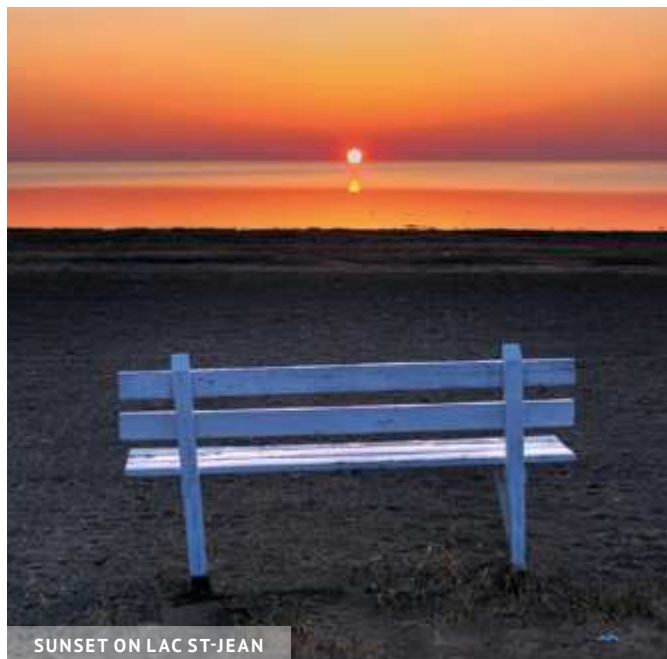
SUNSET ON LAC ST-JEAN