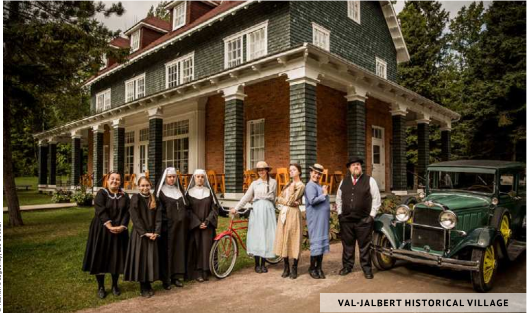
VAL-JALBERT HISTORICAL VILLAGE