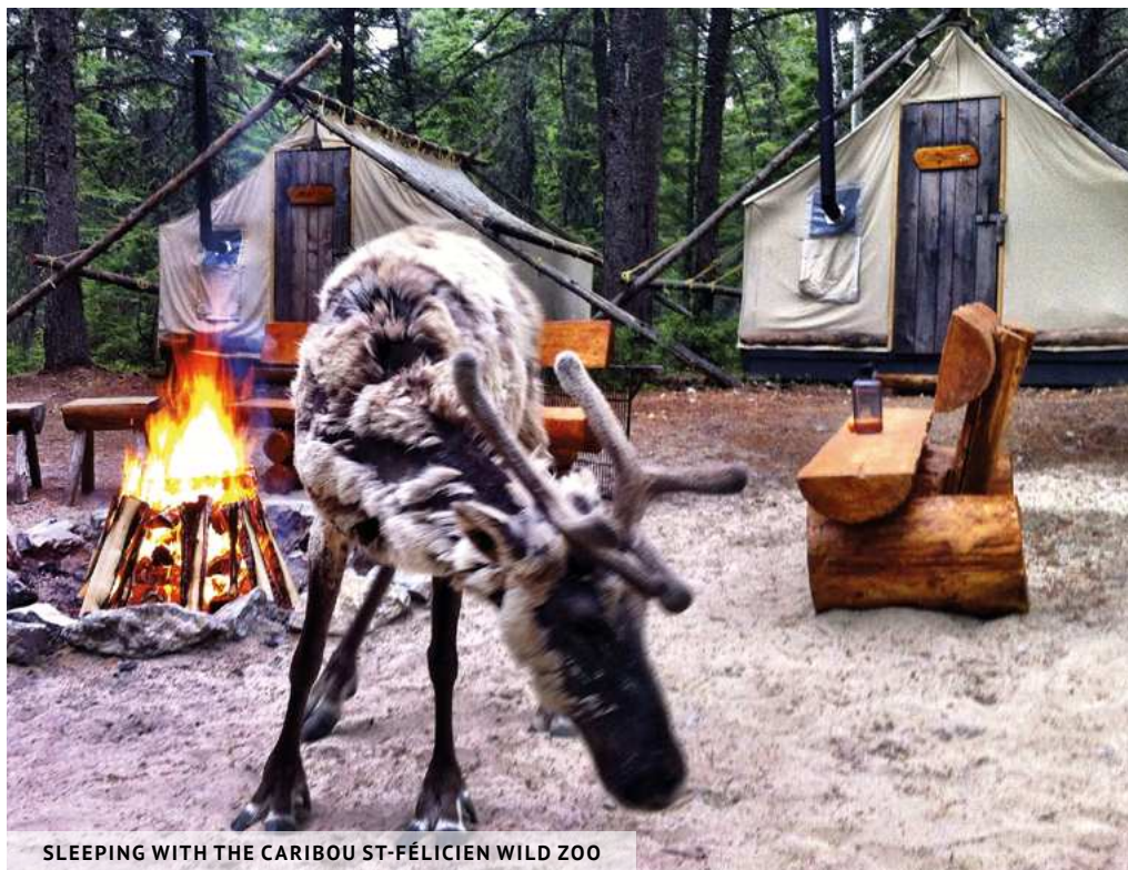
SLEEPING WITH THE CARIBOU ST-FÉLICIEN WILD ZOO

This wild zoo is different from traditional zoos: it houses only animals from Boreal climates , i.e. from the world's northern regions such as Canada, Alaska, northern Russia and certain areas of Asia (Japan) and Europe. There are more than 500 animals of 86 different species and 4.5 km of hiking trail. At Saint-Félicien Wild Zoo, visitors enjoy a unique experience as they take a ride on board a screened-in train along nature trails where humans are in cages, while the animals roam free! You will also find on the site some shops, a main restaurant and several dining areas if you want to bring your picnic. ZOOSAUVAGE.ORG