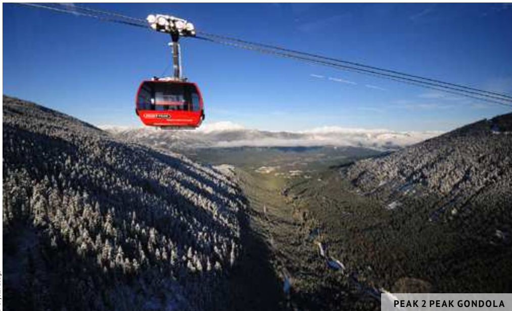
PEAK 2 PEAK GONDOLA