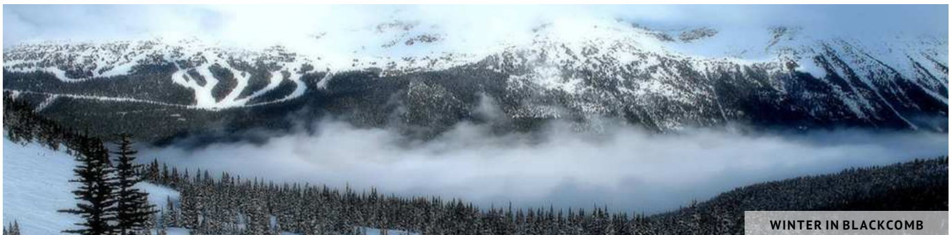
WINTER IN BLACKCOMB