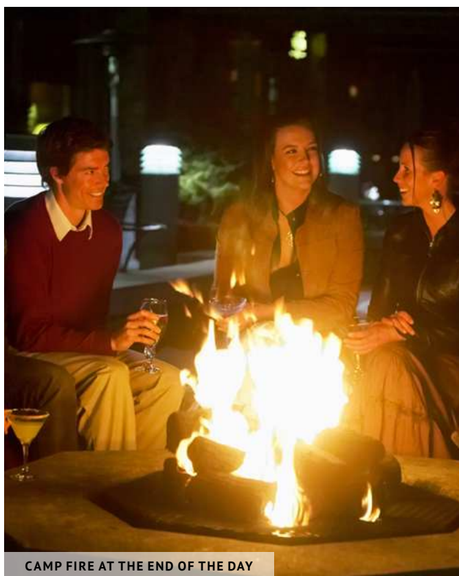
CAMP FIRE AT THE END OF THE DAY