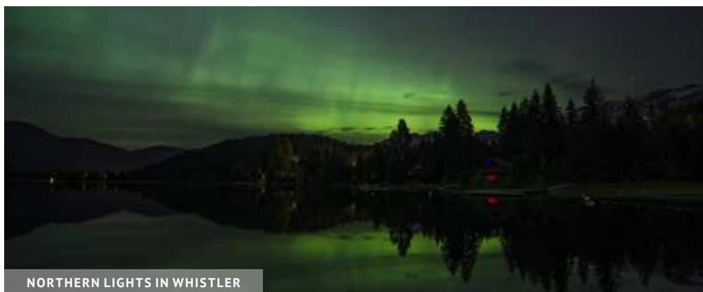
NORTHERN LIGHTS IN WHISTLER

towards Middle Lake and Upper Joffre Lake, the trail becomes steeper and more challenging. The full hike is a 7.7 km round trip. Bookings mandatory. EAST OF PEMBERTON (HWY 99), SUR LE CHEMIN DUFFEY LAKE WWW.ENV.GOV.BC.CA/BCPARKS/EXPLORE/PARKPGS/JOFFRE_LKS