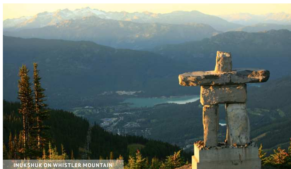
INUKSHUK ON WHISTLER MOUNTAIN

Situated at tranquil Lost Lake, this secluded park offers a sandy beach, pristine swimming waters and more and is within walking distance from Whistler Village. It is a perfect spot to recharge your batteries or to enjoy a quiet picnic. After lunch, hike one of the many trails and drink in the spectacular mountain scenery. The free Route 8 shuttle will take you to Lost Lake in July and August, when there is no parking at the lake. The shuttle leaves from the Gondola Transit Exchange (Blackcomb Way, Whistler), where you can park in one of the nearby pay parking lots (Day Lots 1 to 5). RV parking is available in Day Lot 3.