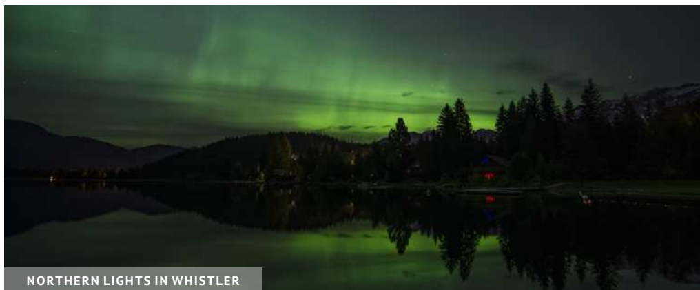
NORTHERN LIGHTS IN WHISTLER

ENV.GOV.BC.CA/BCPARKS/EXPLORE/PARKPGS/JOFFRE_LKS