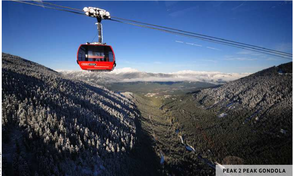
PEAK 2 PEAK GONDOLA