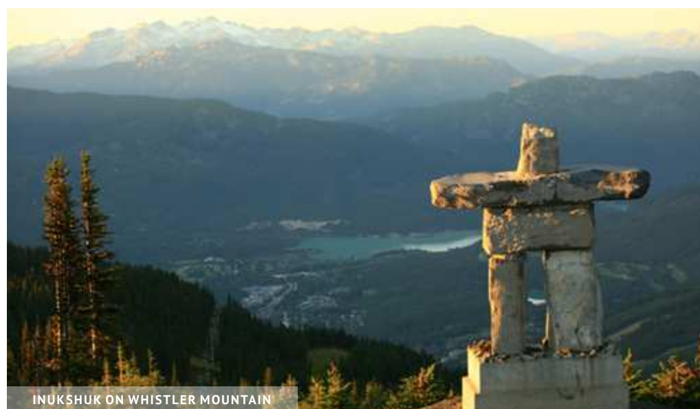
INUKSHUK ON WHISTLER MOUNTAIN

Situated at tranquil Lost Lake, this secluded park offers a sandy beach, pristine swimming waters and more and is within walking distance from Whistler Village. It is a perfect spot to recharge your batteries or to enjoy a quiet picnic. After lunch, hike one of the many trails and drink in the spectacular mountain scenery. The free Route 8 shuttle will take you to Lost Lake in July and August, when there is no parking at the lake. The shuttle leaves from the Gondola Transit Exchange (Blackcomb Way, Whistler), where you can park in one of the nearby pay parking lots (Day Lots 1 to 5). RV parking is available in Day Lot 3.