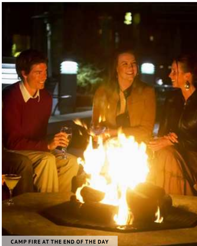
CAMP FIRE AT THE END OF THE DAY