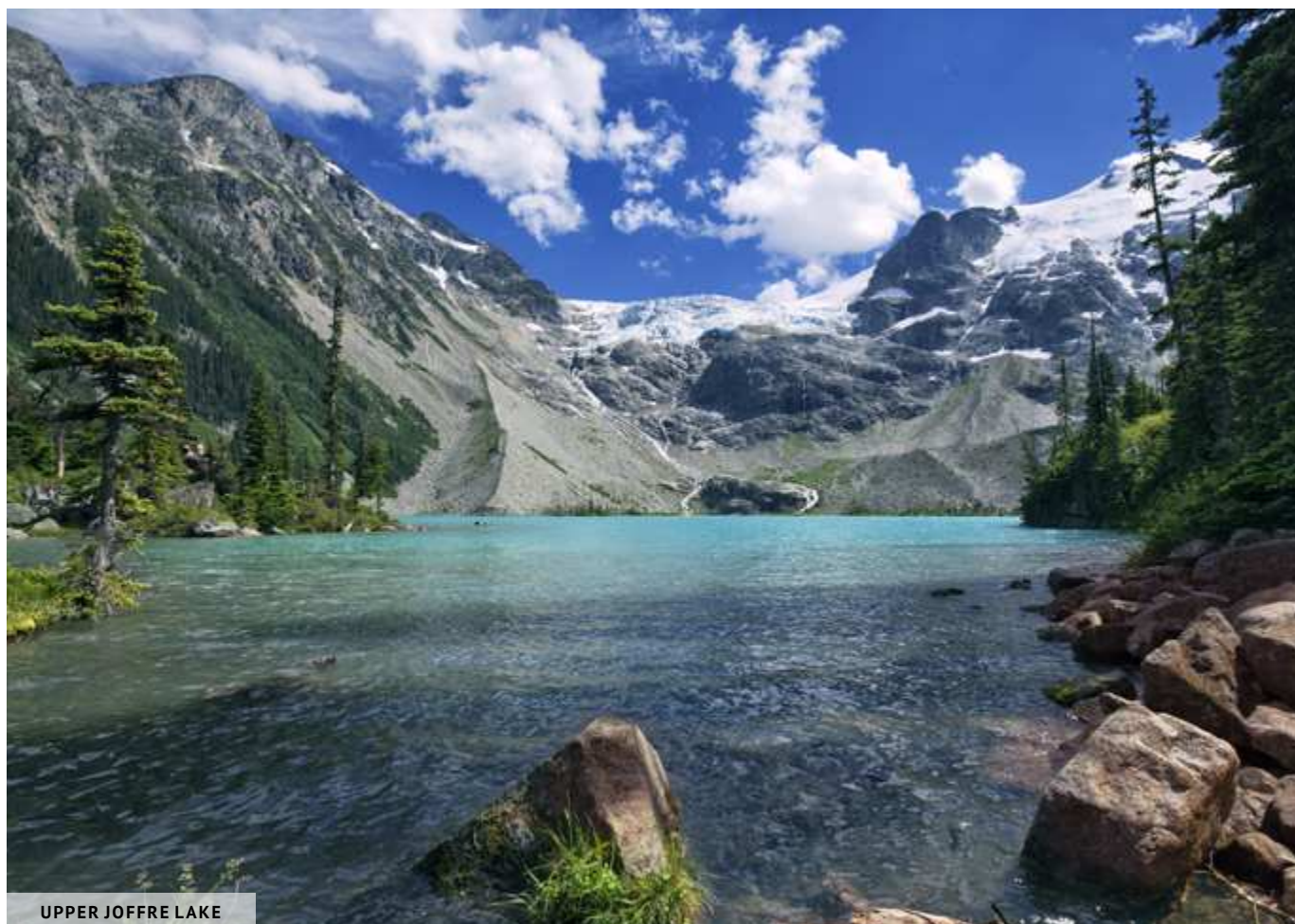
UPPER JOFFRE LAKE