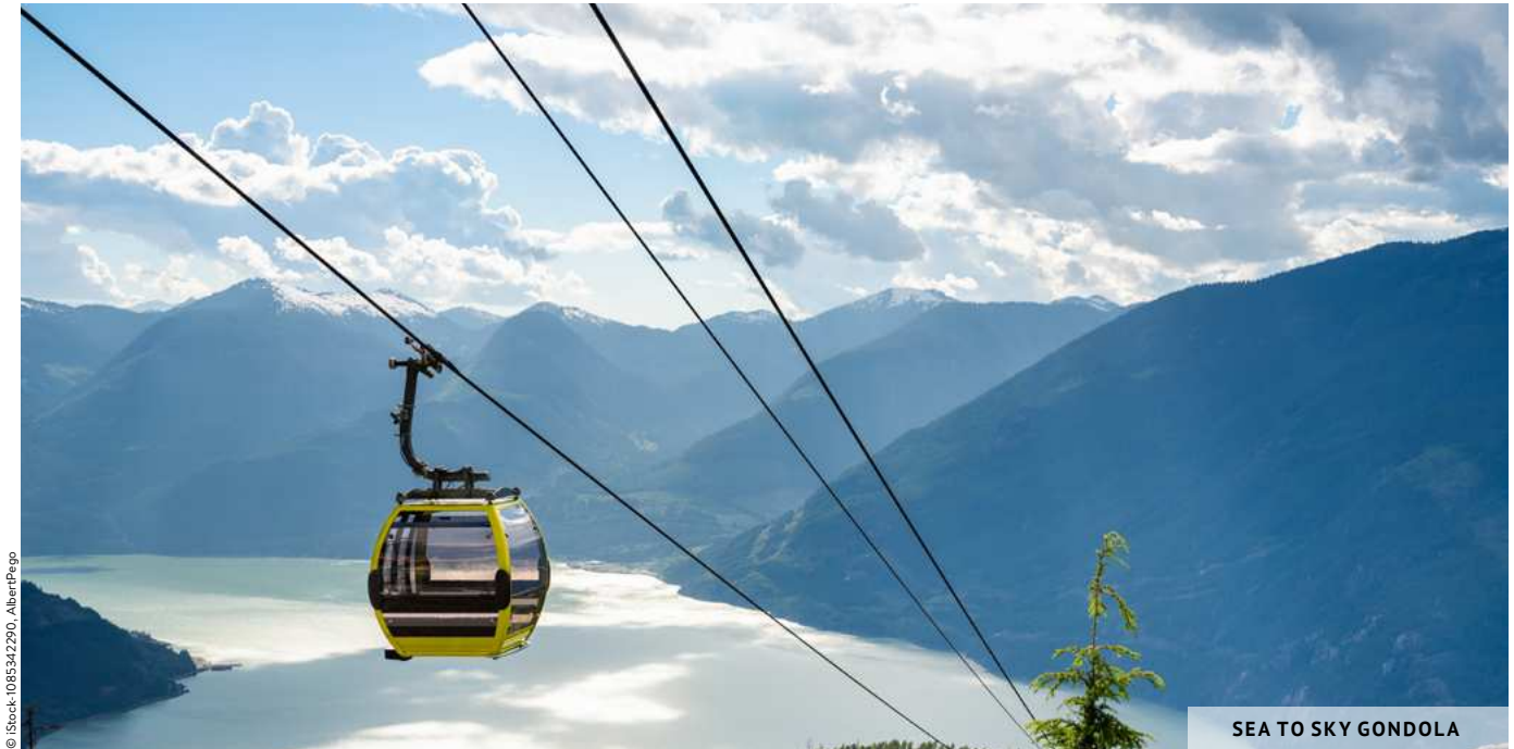
SEA TO SKY GONDOLA

within Brandywine Falls Provincial Park. The waterfall is best seen from the viewing platform, which also presents some marvelous views of Daisy Lake and the surrounding mountains. The 30-minute round trip hike to the viewpoint is easy and well worth the effort! BCPARKS.CA/EXPLORE/PARKPGS/BRANDYWINE_FALLS/