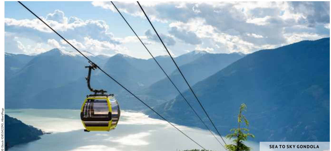
SEA TO SKY GONDOLA

Provincial Park. The waterfall is best seen from the viewing platform, which also presents some marvelous views of Daisy Lake and the surrounding mountains. The 30-minute round trip hike to the viewpoint is easy and well worth the effort! 604-986-9371 BCPARKS.CA/EXPLORE/PARKPGS/BRANDYWINE_FALLS/