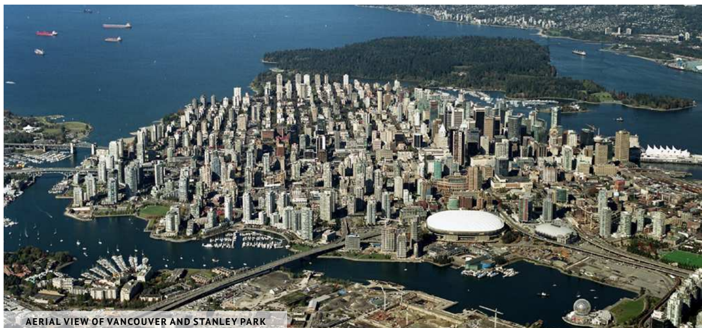
AERIAL VIEW OF VANCOUVER AND STANLEY PARK