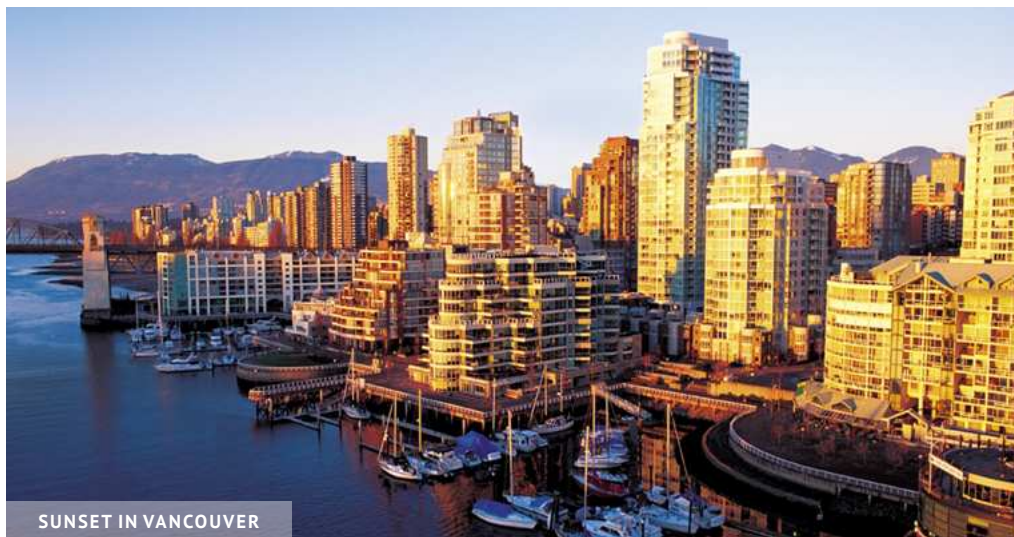
SUNSET IN VANCOUVER

In the mood for some shopping ? Robson Street , in the West End , and Broadway Avenue , in Kitsilano , are two shopping destinations that are popular with locals and tourists alike, offering fashion and more for everyone and every budget. In fact, two well-known Canadian brands originated in these areas of Vancouver a number of years ago: Mountain Equipment Co-op (MEC) , Canada's largest supplier of outdoor equipment, and Aritzia , an innovative women's fashion boutique.