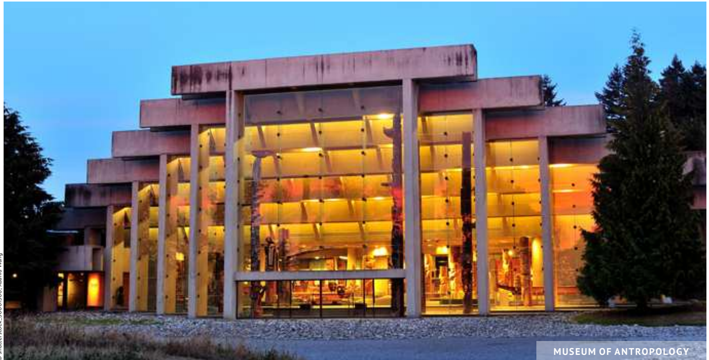
MUSEUM OF ANTHROPOLOGY