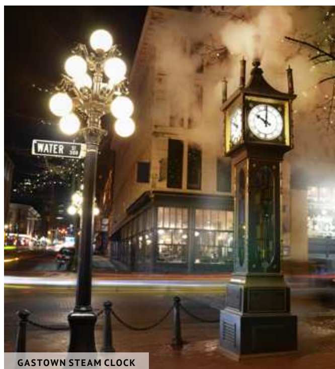
GASTOWN STEAM CLOCK

845, AVISON WAY (STANLEY PARK), VANCOUVER 604-659-3474 WWW.VANAQUA.ORG