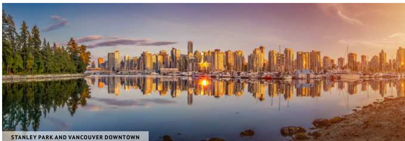
STANLEY PARK AND VANCOUVER DOWNTOWN