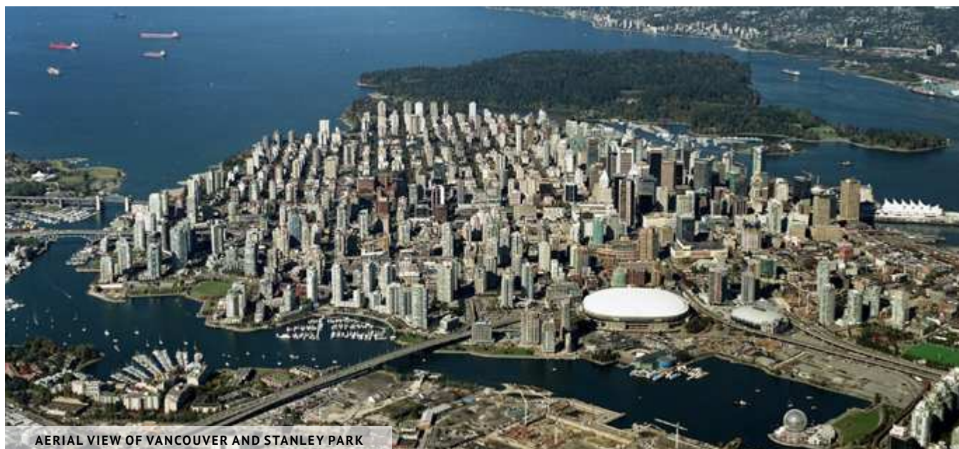
AERIAL VIEW OF VANCOUVER AND STANLEY PARK