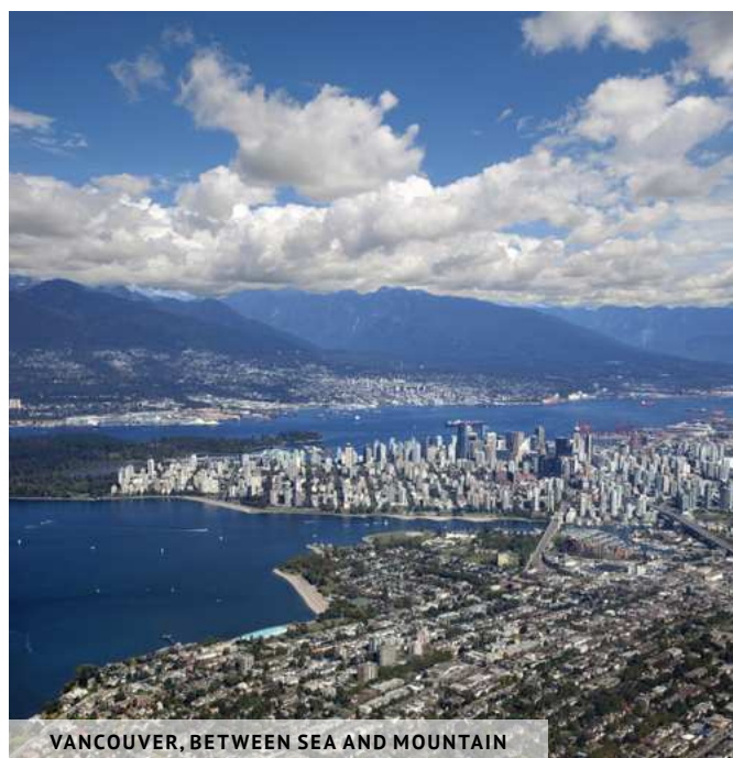
VANCOUVER, BETWEEN SEA AND MOUNTAIN