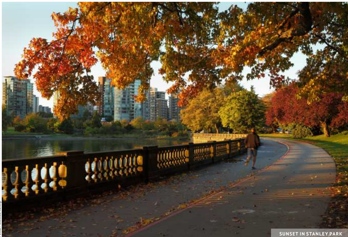
SUNSET IN STANLEY PARK