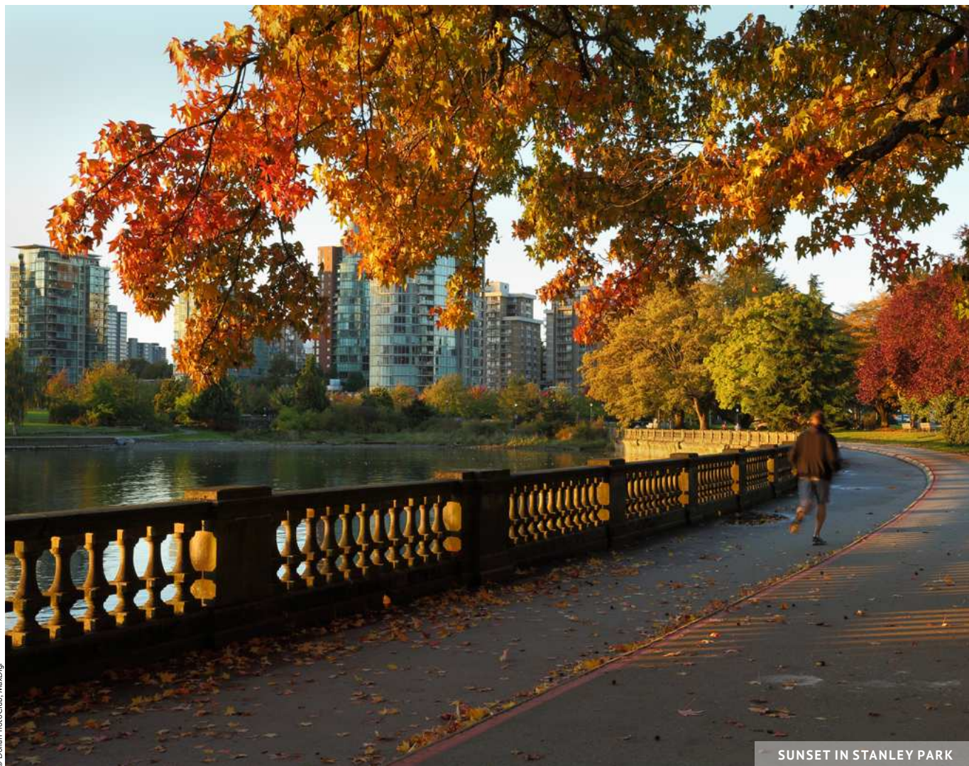
SUNSET IN STANLEY PARK