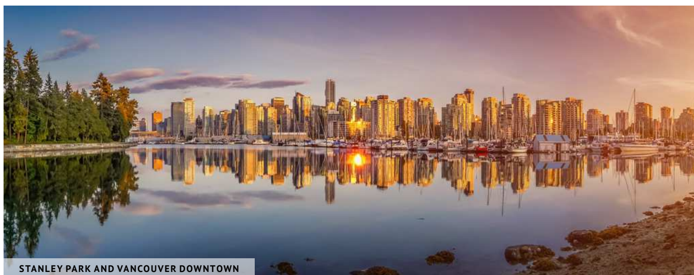
STANLEY PARK AND VANCOUVER DOWNTOWN