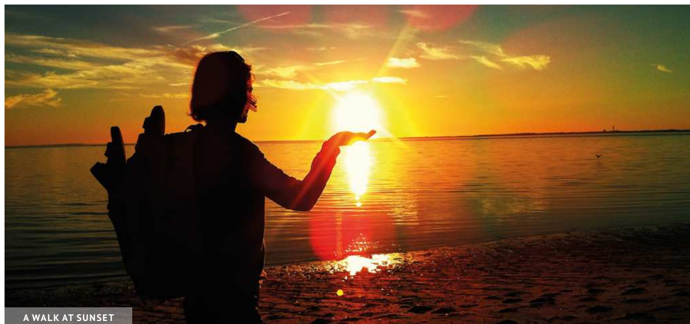
A WALK AT SUNSET